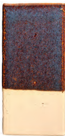
AMACO No.46 Buff Stoneware