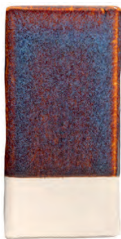
AMACO No.11 A-Mix White Stoneware

Clay body can affect your work just as much as glaze. Check out how DL-33 Low Tide shifts from clay body to clay body. All fired to Cone 5.