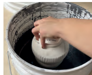
Dipping with Fingers