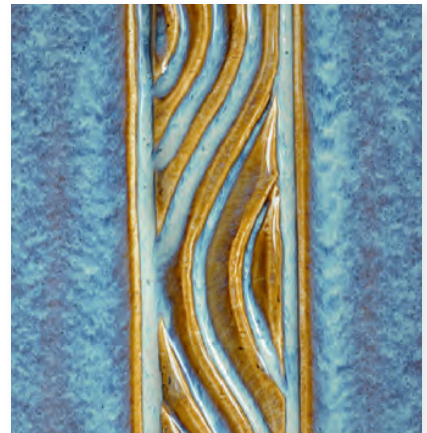
DL-20 Floating Blue