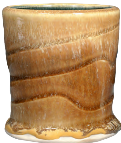
DL-70 Oxblood over DL-60 Honeycomb