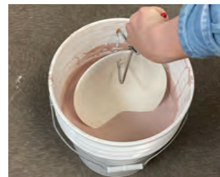
Dipping with Tongs