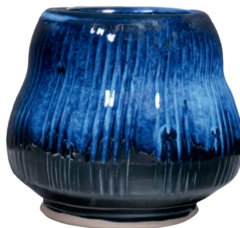
DL-23 Ultramarine over DL-1 Ebony