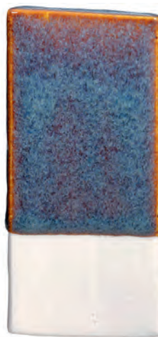
Laguna Frost Porcelain