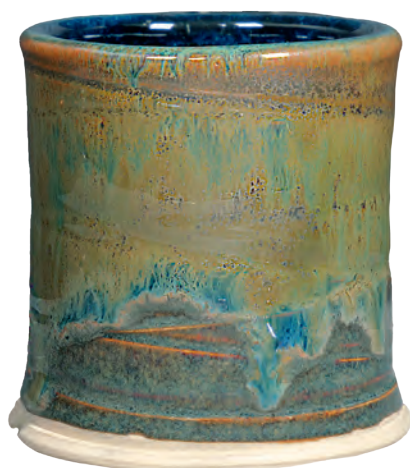
DL-42 River Moss over DL-33 Low Tide