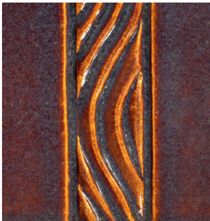
DL-33 Low Tide