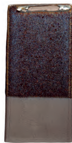
Kentucky Mudworks Brown Bear