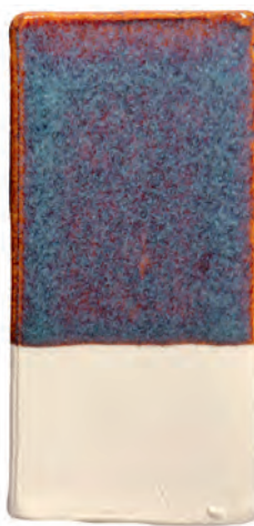
Aardvark Nara 5